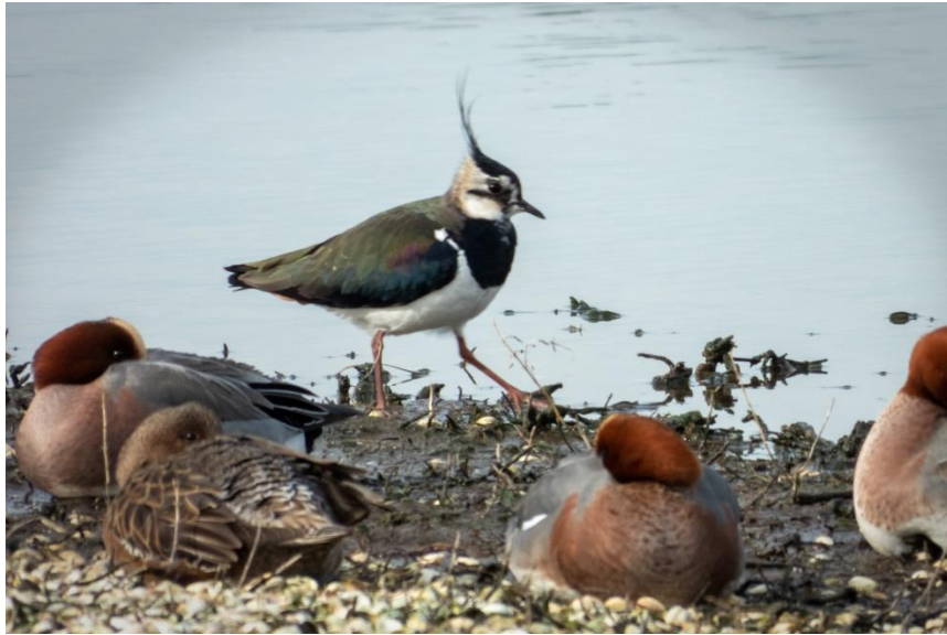
Lapwing and Wigeons

On one of the few dry, sunny days in February the Birdwatching Group met on Two Tree Island in Leigh. We had a few misgivings - would the paths be deep in mud and would the Golf Range Cafe be open for our usual hot drink after our walk??