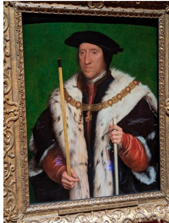
Thomas Howard Duke of Norfolk