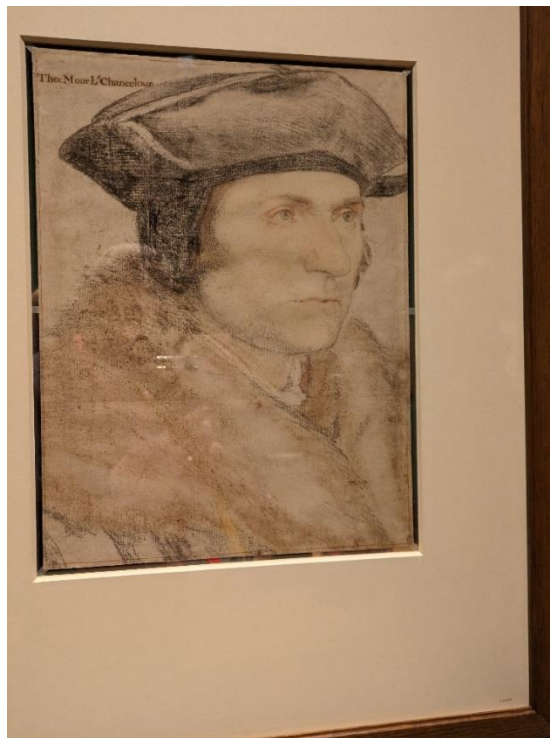
Thomas Moor (sic) Lord Chancellor

The Art Appreciation Group's latest day out was to the Queen's Gallery at Buckingham Palace to see their collection of works by the great artist Holbein. He was a brilliant painter of portraits, usually preparing a sketch in advance to work from. These sketches are great pieces of art in their own right.