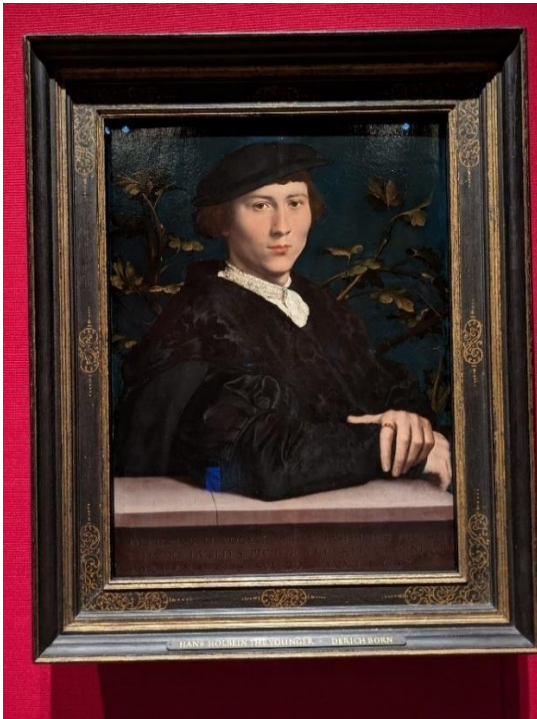
Hans Holbein the younger

The exhibition covers pieces from Holbein's time working at the Tudor Court for nobility and Henry VIII where he was a very popular artist. He also sparked the design of ornamental items and armour. A good trip was had by all.