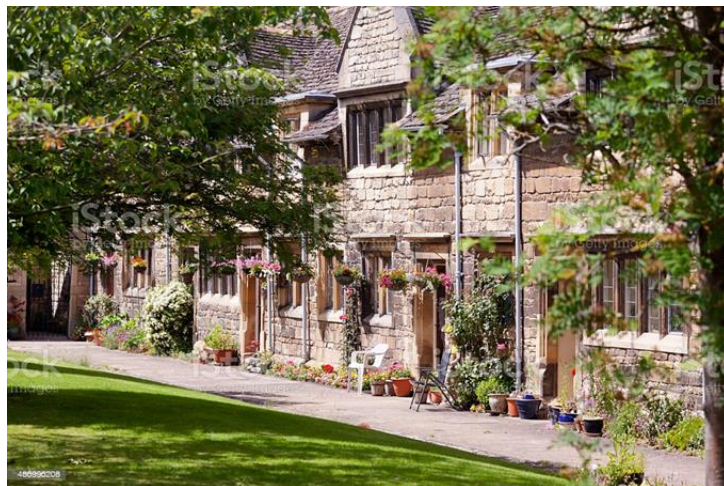
Medieval ‘hospital’ still in use as a community almshouse

In medieval times the town thrived because of the wool trade. There were four orders of friars at the time and six ‘hospitals’ were set up by monks to look after the poor and infirm. Some of these still exist and are used to house elderly members of the community.