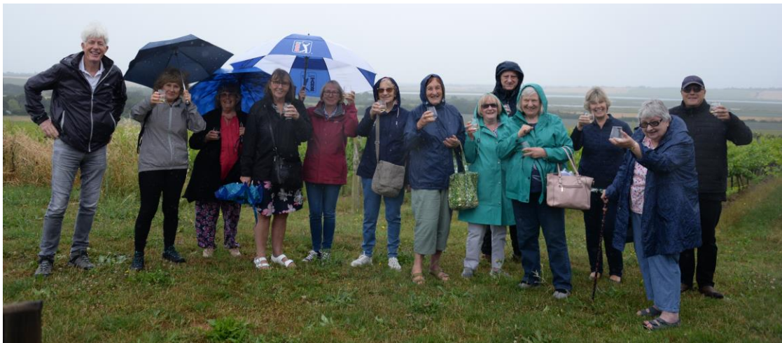
Members of both our Wine Appreciation Groups getting a soaking