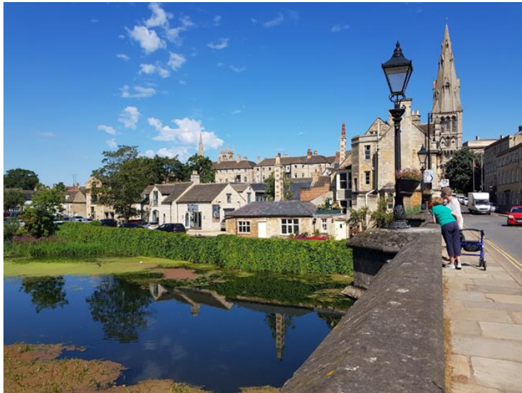
View of the river with medieval church in the distance

Our trip to Stamford town was surprisingly pain-free and only took a couple of hours. Stamford is a beautiful town. Sir Walter Scott declared it “the finest stone town in England” and it was made a conservation area in 1967. It has over 600 listed buildings of mellow limestone including five medieval churches and a range of Georgian architecture. There are picturesque views everywhere and an attractive river walk.