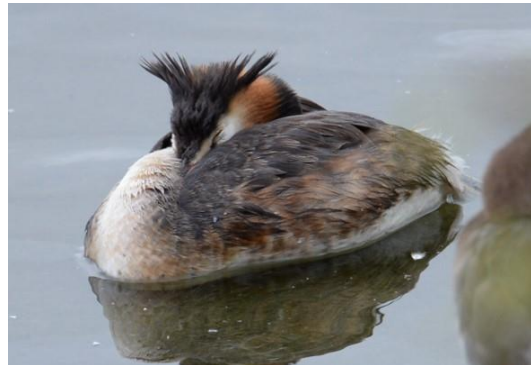
Great Crested Grebe