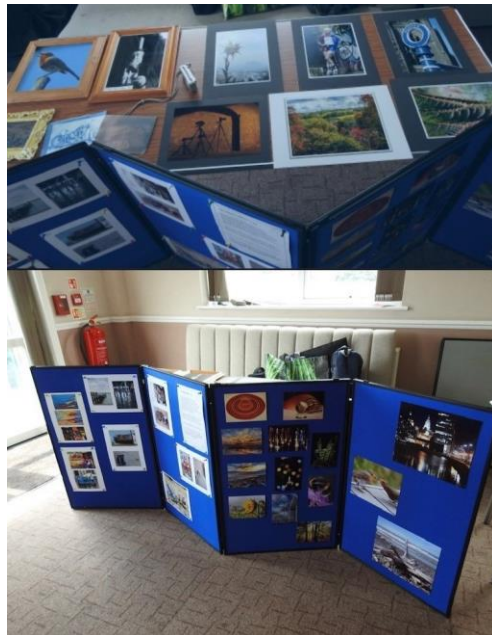
Friday Photography Group Displays at our AGM meeting in July