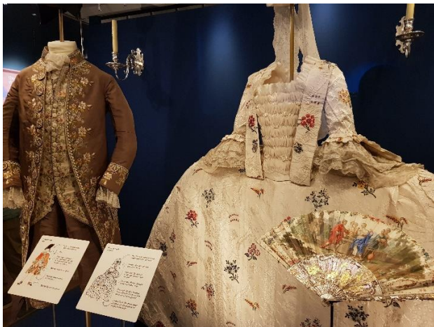
Wide dresses and lots of embroidery

The tour took us through the Crown to Couture exhibition first. Reviews had praised it as a major event with The Times calling it “The court of George the second meets Beyonce and Lady Gaga”. The information on display showed how in Georgian times extravagant court dress was used to display wealth and power with audiences applauding the most extreme and richly decorated members at court events. This was true of men as well as women.