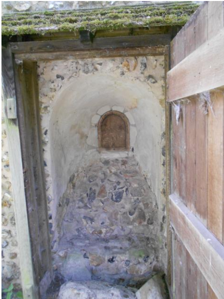
The anchorite's cell set in the exterior wall of the building