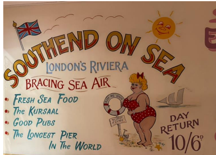
Spotted in the Ladies Loo!!

Then the show started. It brought back all the songs of our youth with the performers dressing up to try to resemble the actual stars of that time. We all sang along with gusto. Everything was very 'tongue-in-cheek' with a lot of comedy and innuendo. It was often rather politically incorrect which had the audience roaring with laughter. None of us wanted it to end.