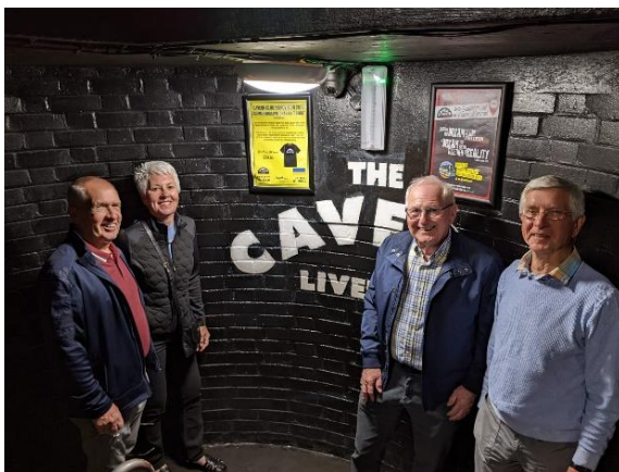
The Cavern Club

The final day we had the morning free to continue to explore our own choices of locations and activities. The Tate Gallery had some challenging art installations, but help was on hand to explain their meaning! The Mary Walker Art Gallery had a wonderful range of art matching anything in London and the Liverpool Museum explored the history of the city through many iconic items. In the afternoon a guide joined our coach for a Magical Musical tour of the city focussing on all the places relevant to the music scene, but also showing some of the other notable buildings. Many of us made the most of our location to visit the famous Cavern Club and some of us were lucky enough to see a wonderful local band become The Beatles. A room full of people singing along with every song – it was a great night!