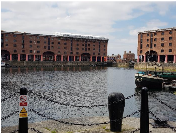
Albert Dock and Tate Liverpool