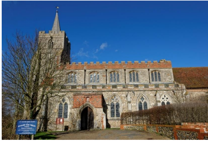
St. Mary the Virgin, Stebbing

In complete contrast to the tiny church at Lindsell this much larger building's crowning glory is the wonderful three-arch rood screen with intricate tracing spanning the wide chancel arch. The nave is wide, light and spacious. Our very affable guide took us round pointing out the interesting features including a beautiful brass of a medieval lady set in the floor of the nave.