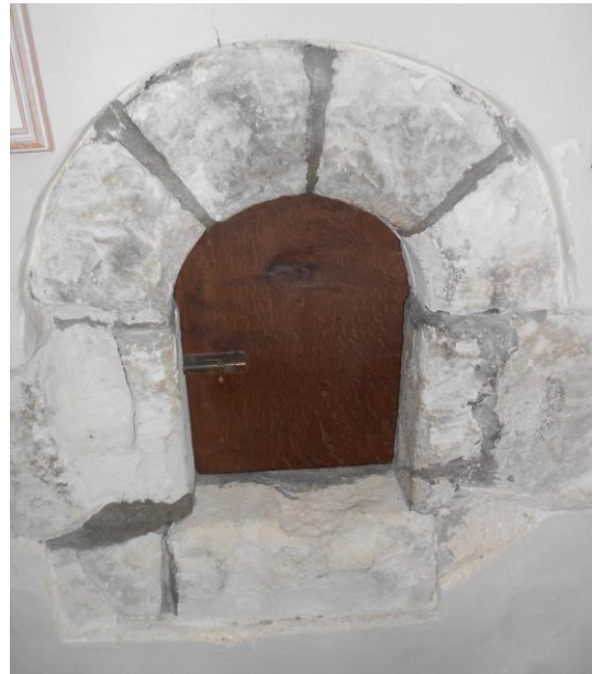
The tiny interior window where the Anchoress could view the altar and receive the sacrament

The entrance to the church is through farm buildings. The village was once much larger than it is today with a population of 407 in 1871, but the population fell rapidly to 187 which is about the number of its inhabitants today.