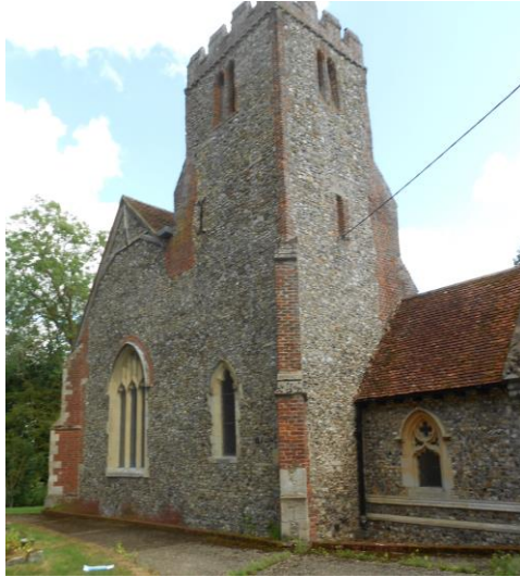
St. Mary the Virgin, Lindsell

It was a glorious day for our June Church Visits. The first was to St. Mary the Virgin in the village of Lindsell. This endearing little church is set in an unspoilt, rustic setting approached between barns and other farm buildings and next to Lindsell Hall. Our guide took us to the rear of the church to see the 12 th century anchorite cell. Here, with the authority of the Bishop, the anchoress, after receiving the Last Rites, spent the rest of her life living alone in the shadow of the church, following an approved rule of life. Evidently there were up to 500 ladies who chose this way of life in medieval England, the most famous being Mother Julian of Norwich.